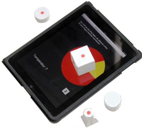
Figure 4. A working Sketch-A-TUI prototype showing the graphics it is controlling on an iPad.

and interviewed the designers: their experiences were quite encouraging as the whole team highly appreciated the opportunity of creating early expressions of their ideas on the fly. Importantly, they stated that, prior to Sketch-A-TUI, they used non-interactive 3D renderings and mockups of their early ideas, which limited their internal design process.