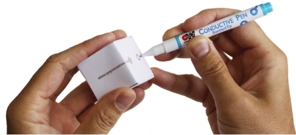
Figure 1. Sketching conductive ink on a cardboard object creates a tangible object recognized by a capacitive surface.

Tangible User Interfaces (TUIs) were conceived as a way to link digital bits with physical objects [2]. The basic idea is that people can interact with that digital information by grasping and manipulating physical things [5]. Our own interests are in designing interactive tangibles that work